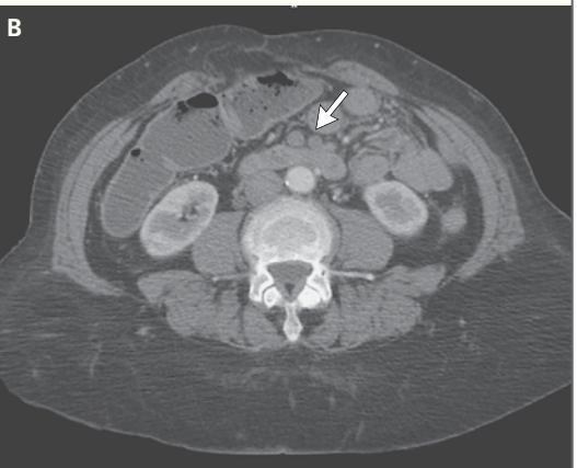
Figure 1. Computed Tomographic Angiography (CTA) in a Patient with Acute Mesenteric Ischemia Caused by an Embolism in the Superior Mesenteric Artery.

This patient, who had atrial fibrillation and was not receiving anticoagulant therapy, had an acute onset of severe abdominal pain and bloody diarrhea. Panel A shows a sagittal CTA image of a long-segment occlusion of the superior mesenteric artery (arrow). The occlusion was caused by an acute embolism beyond the origin of the superior mesenteric artery. Panel B shows an axial CTA image of complete occlusion of the superior mesenteric artery (arrow) with dilated loops of small bowel.